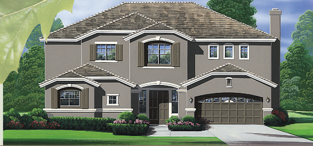
[ T A N G L E W O O D ]