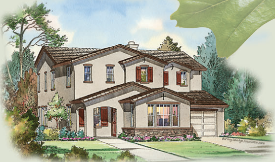
[ C O R T I N A ]